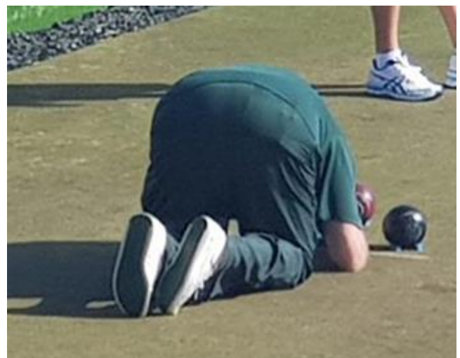
Umpiring is not all head down, bum up!!